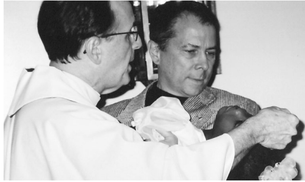
Baptism of a young child

The Blessed Trinity, three persons in one God, is a profound mystery. Because it reveals who God is in his inmost being, the mystery of the Blessed Trinity “is the central mystery of Christian faith and life” (CCC 234; italics added). This mystery is not illogical,