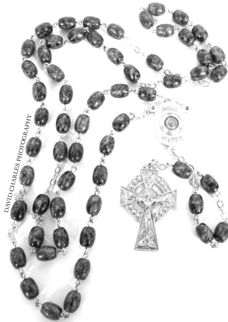
A rosary from Ireland

Glory to God in the highest, and peace to his people on earth.