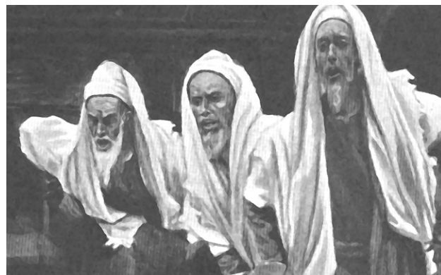
The Pharisees accusing Jesus, by James Tissot, 1856-1902

“The seven deadly sins are perverse inclinations that cloud our consciences and distract our judgment of what is good and what is evil.”