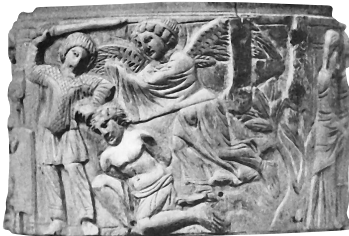
Martyrdom of St. Menas, 6th century ivory carving from Alexandria, Egypt

If he wished, God could eliminate all evil. He would accomplish this, however, only by removing free will from us. Without free will, though, we would no longer be truly human. We would no longer be kind or generous or thoughtful. We would no longer love, for love requires freedom. Due to our fallen nature and tendency to sin, evil will exist until the end of time, as Jesus tells us: "The Kingdom of Heaven may be compared to a man who sowed good seed in his field; but while men were sleeping, his enemy came and sowed weeds among the wheat, and went away. So when the plants came up and bore grain, then the weeds appeared also. And the servants of the householder came and said to him, 'Sir, did you not sow good seed in your field? How then has it weeds?' He said to them, 'An enemy has done this.' The servants said to him, 'Then do you want us to go and gather them?' But he said, 'No; lest in