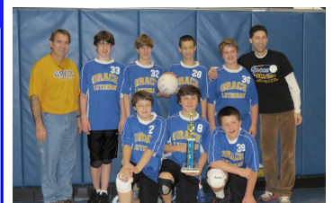
Here's a picture of our boys VB team with their 2nd place trophy won at the Our Father's Annual VB Tournament!!