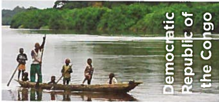
Democratic Republic of the Congo