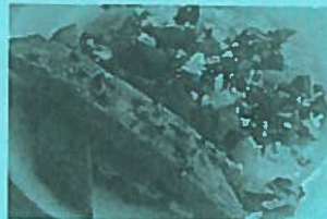
Bread and Salad