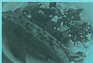
Bread and Salad