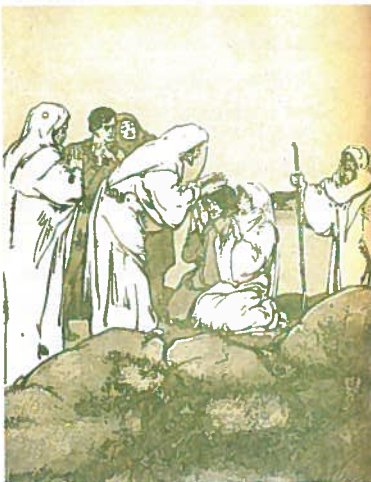
These pictures are from the flyleaves of the 1908 Harper edition.

For five years after its publication, Ben-Hur sales were sluggish. But as word of mouth traveled, sales rocketed and remained high. Even as late as 1913, when a Chicago mail-order company bought a million copies of Ben-Hur , it had no trouble distributing them all.