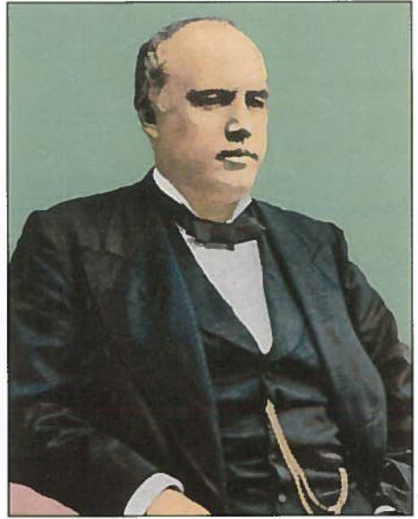
The famous skeptic Robert Ingersoll

To explain this, it is necessary now to confess that my attitude with respect to religion had been one of absolute indifference. I had heard it argued times innumerable, always without interest. So, too, I had read the sermons of great preachers...but always for the surpassing charm of their rhetoric. But—how strange! To lift me out of my indifference,