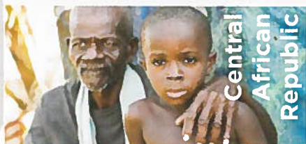
Central African Republic