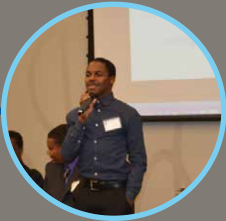
GK-DC Leader presented at a talk-back about his trip to South Africa.

Through a grant from the 21st Century Community Learning Centers, GK-DC has been able to bring its programming to two underserved high schools in DC, Anacostia High School and Ballou High School, and we hired two new staff members to meet the needs of these programs.