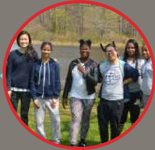
Almost 50 middle schoolers attended the 2nd annual middle school retreat at Princeton-Blairstown Center.

Both Global Kids middle schoolers and high schoolers participated in Global Kids' digital media curriculum in the Online Leadership Program. Middle schoolers gained radio production skills through our partnership with WNYC's Radio Rookies program, and how to examine and recreate current news media in Mediabreakers, a program with The Lamp. High schoolers learned tech skills in our Hive NYC partnership citywide program, Young Innovators Squad, a youth-led maker space program.