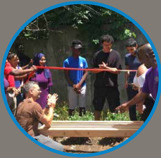
Students from Curtis High School built a community garden in a low-income housing building.

In our signature program, Power of Citizenry , students explore issues such as global health, poverty, children's rights, sustainability, discrimination, and human rights through workshops, field trips, guest speakers, mentoring, and hands-on service projects. The program equips youth with the skills and knowledge they need to succeed in school and participate in shaping international and public policies in an ever-changing, complex world. The program culminates in the Annual Youth Conference, entirely conceived and produced by Global Kids students. In 2015-2016, they chose to explore the topic of migration/immigration.