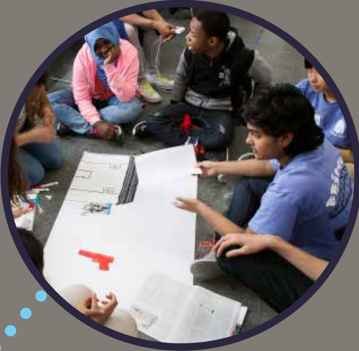
GK middle schoolers facilitated workshops on immigration at the 2016 Annual Youth Conference.

Our middle school programs continue to thrive. This year, Global Kids had programs in eight school sites, working with over 550 middle schoolers each week. For the first time, GK middle schoolers wrote and facilitated workshops at our Annual Youth Conference. Fifty middle schoolers participated in our second annual overnight retreat. Over 100 students had a chance to participate free of charge in our enriching and fun middle school summer camps in New York City.