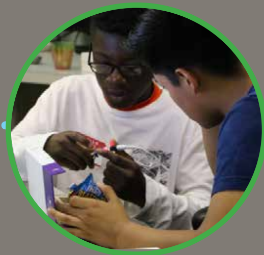
GK high school students working with littleBits at the Young Innovators Squad meet-up.