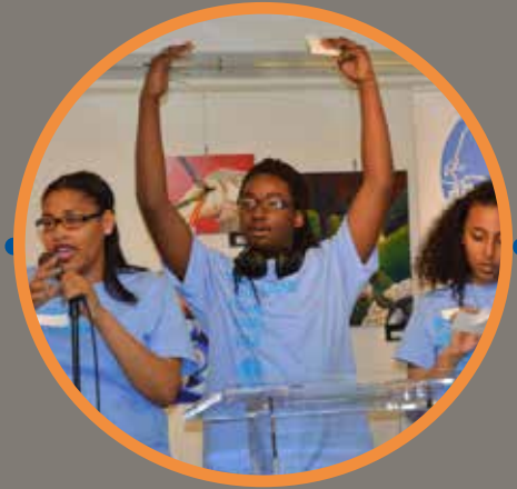
GK-DC Leaders emcee'd the GK-DC Annual Youth Conference.

Mayor Bill de Blasio launched a major effort to create more community schools in order to bolster academic achievement for New York City public school children. As part of this initiative, community based organizations (CBOs) have been called upon to partner with schools to provide much needed services. Global Kids serves as the lead CBO in three schools in the Bronx, Manhattan and Queens. Working with other CBOs, school leaders, and community stakeholders at Bronx Studio School for Writers and Artists (BSSWA), Global Neighborhood Secondary School (GNSS) and John Adams High School, Global Kids provides comprehensive programming centered on youth development, social and emotional wellness, and community engagement.