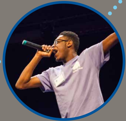
Over 600 students and educators attended our 2016 youth-led conference, Build Bridges Not Borders .