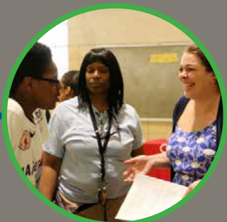
GK staffer with parents at the GNSS Community Forum.

Mayor Bill de Blasio launched a major effort to create more community schools in order to bolster academic achievement for New York City public school children. As part of this initiative, community based organizations (CBOs) have been called upon to partner with schools to provide much needed services. Global Kids serves as the lead CBO in three schools in the Bronx, Manhattan and Queens. Working with other CBOs, school leaders, and community stakeholders at Bronx Studio School for Writers and Artists (BSSWA), Global Neighborhood Secondary School (GNSS) and John Adams High School, Global Kids provides comprehensive programming centered on youth development, social and emotional wellness, and community engagement.