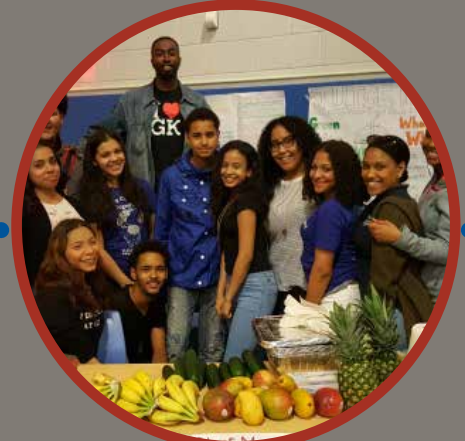
Global Kids organized a health fair at BSSWA.