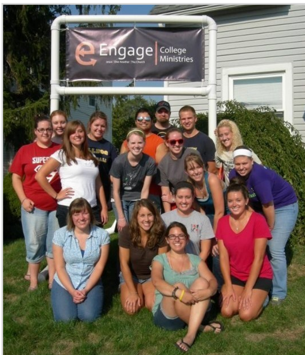
University of Findlay students having fun at "The Gateway House".