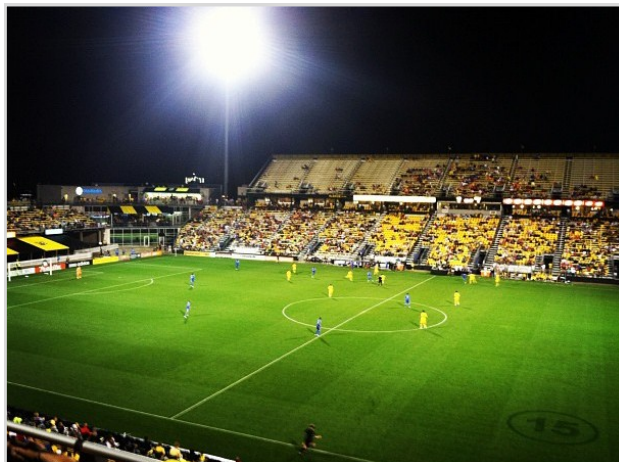
Crew Stadium under the lights.

Thirty students and adults traveled to the Columbus Crew soccer game on September 1. Even though it was rainy and wet, they were treated to an action filled game. The Crew won their fourth game in a row, defeating the Montreal Impact (2 to 1). The win advanced the Crew into a three way tie for third place in the Eastern Conference.