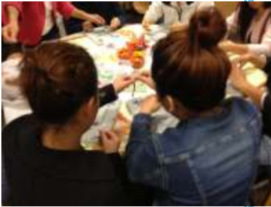
During a Thanksgiving party, women staying at a shelter work on a craft.

Since its beginning, the GVBC Neighborhood Ministry has been a strong advocate of partnering alongside local community organizations that help to bring healing and restoration to our city. We’re excited to support CPAF and be supported by them as well. We believe this partnership will help us continue to show our community the transformative power and the unconditional love of Jesus Christ.