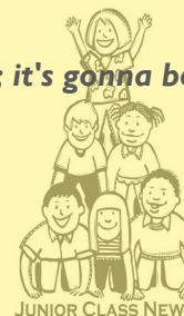
JUNIOR CLASS NEWS