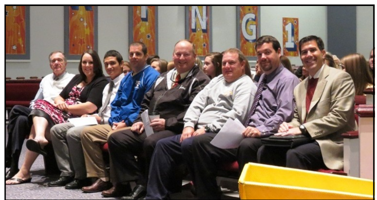
Thank you, coaches, for a great fall season!

VOLLEYBALL CHEERLEADING FOOTBALL TENNIS CROSS COUNTRY