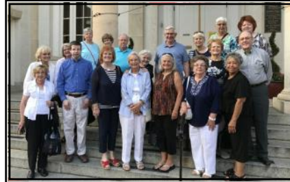
"Ragtime" play in Murfreesboro, TN

Time is running out to make reservations for the Honor Flight of Middle Tennessee . The tour date is Wednesday, September 13th, 2017. Pick up an application and more information in the church office or see Esther.