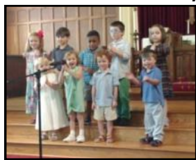
Halos singing on Mother's Day

VBS registration is happening now. Please register your child online at www.cokesburyvbs.com/fumctullahoma .