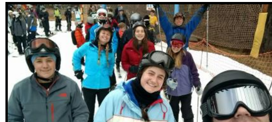
Youth having a blast on the slopes this weekend!

All parents and youth interested in Confirmation this year, please join us for a meeting about the Confirmation journey this Sunday, January 22nd at 6 pm in the dining room of the FAC. Confirmation is typically open to sixth graders but also for other youth who may be wanting to explore their faith more deeply. We will explain the Confirmation process, review the schedule for this year, and answer any questions you may have.