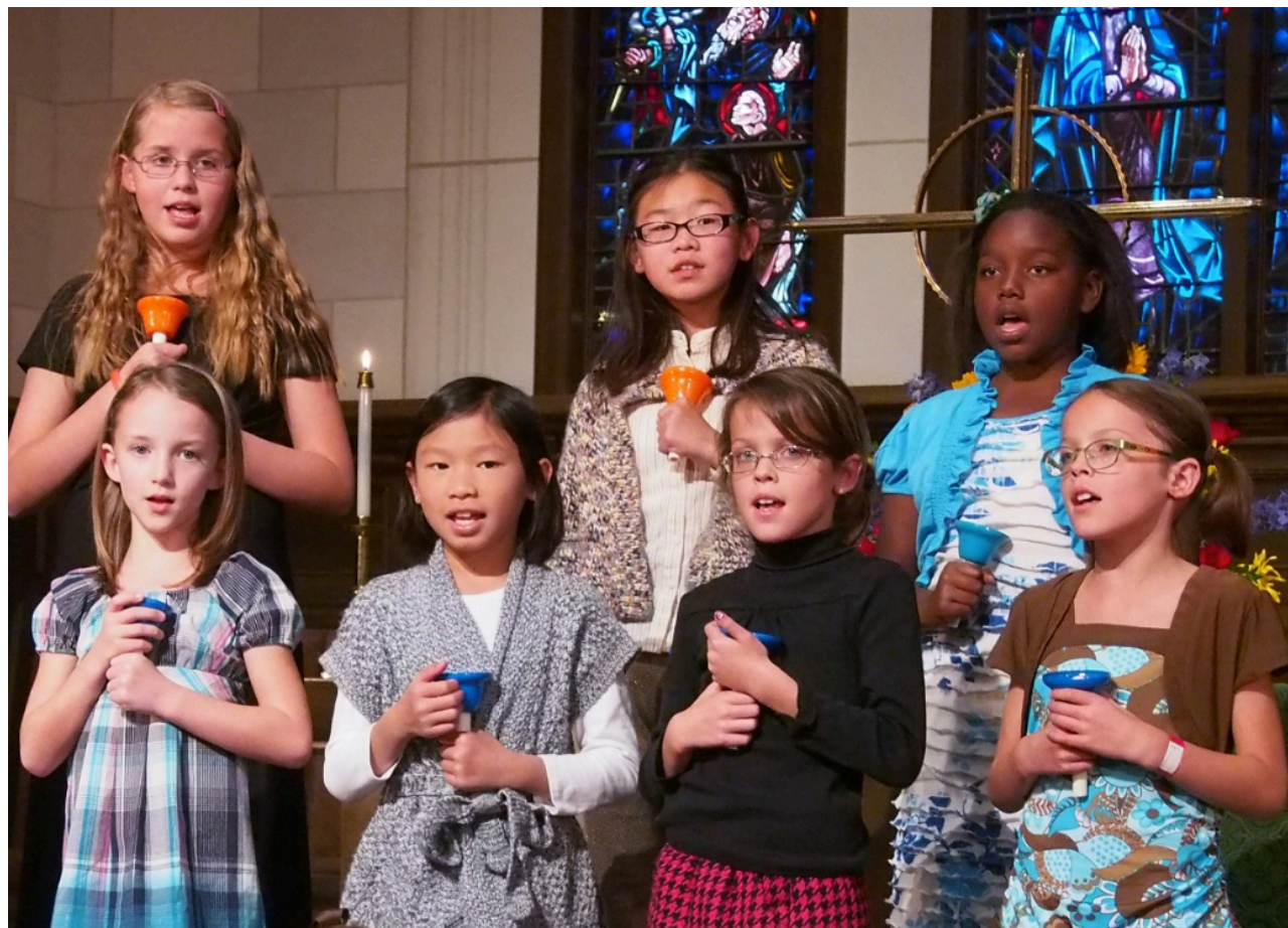
Praise Kidz II sang and rang at 11 o'clock service last Sunday morning.