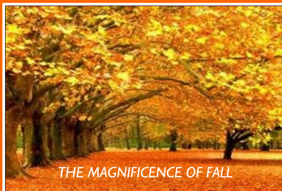
THE MAGNIFICENCE OF FALL