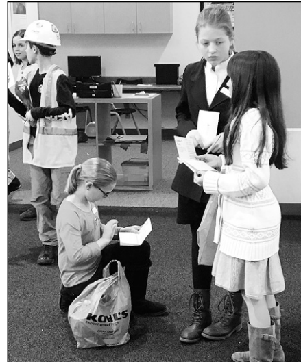
Left and right, students from First Immanuel Lutheran School participate in activities during their visit to Junior Achievement BizTown.