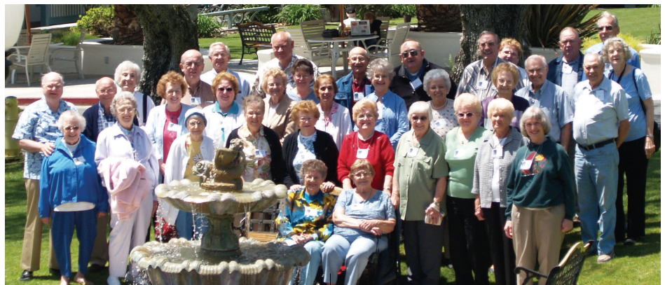
PrimeTimers at the Tri-District Retreat