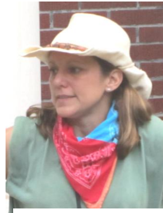
A record crowd has turned out to explore the UNTAMED NATURE OF GOD at VBS