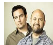
THE SKIT GUYS