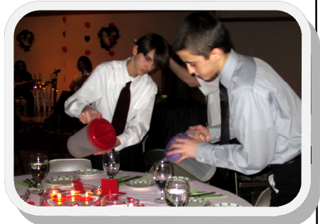
Valentines Dinner February 14