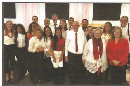
December Outreach - Christmas Choral Program