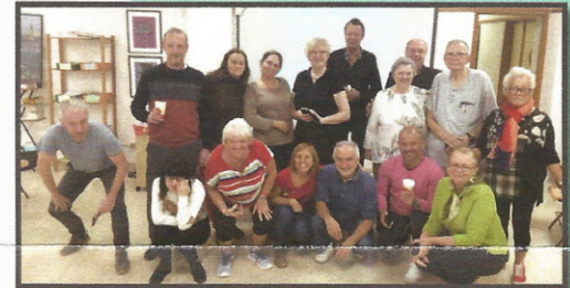
Our Spanish language study class.