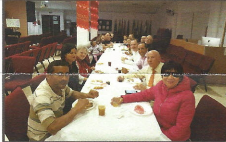
International Family Dinner

February marked the end of the "Carnival" in Gran Canaria with all of its fiestas and celebrations. We also have cause to celebrate but we celebrate in a different way and for different reasons. We are grateful to God for the growth we have experienced in the church. We have seen through the work of the Holy Spirit an increased depth of worship and maturity in our youth. At the last water baptism, over half of those were from our youth group.