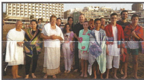
Water Baptism Group