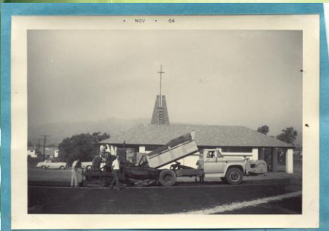
PAVING STARTED 11-2-'64