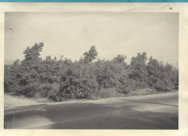
CHURCH SITE ON BONITA AVE. 12-1-'63