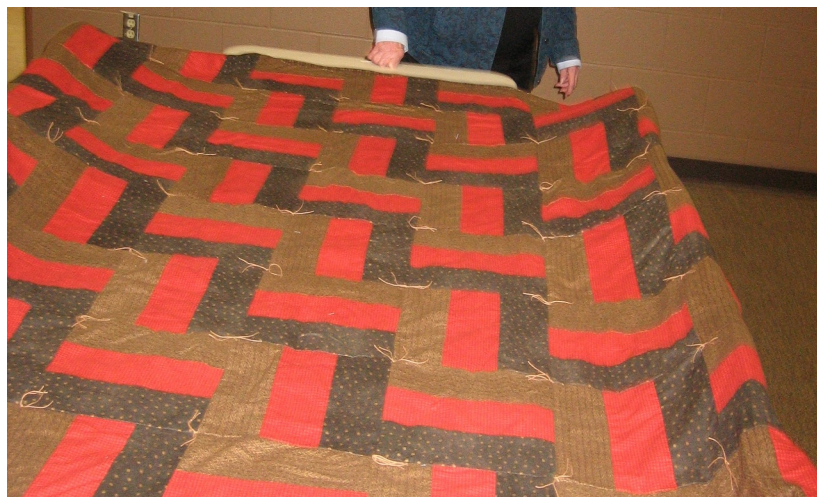
Quilt made by the Sewing Group. Money raised by this group goes to sponsor a variety of mission projects.

All items included in kits must be NEW items. Kits are carefully planned to make them usable in the greatest number of situations. Since strict rules often govern product entry into international countries, it is important that kits contain only the requested items, nothing more.