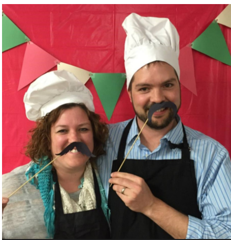
CCM Volunteers - Photo Booth Fun!