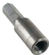
3032 Rail Bolt Driver

Tools Needed: 1/4" Twist Bit, 3/8" Twist Bit or 1/2" Spade Bit, 1" Spade Bit, #3032 Rail Bolt Driver, # 3044 Rail Bolt Wrench