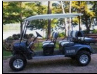
New Camper Transport

Mike Audette we have had nearly 100% coverage of the ships calling into South Boston. No small feat during the busy cruise ship season. Transport was a challenge, but we were successful in helping those seafarers and providing a dependable presence on board their ships. We are looking forward to possible partnerships with new church plants in the South Shore area of Metro Boston to help cover industrial ship visits.