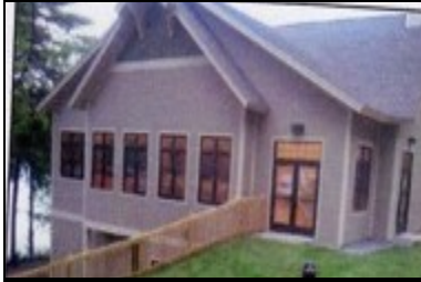
Camp Squanto's new Dining Hall

The trustees of The East Coast Conference (ECC) met October 15th at the Berlin Church for their quarterly meeting. During this quarter I will use the Salt Shaker to inform you of some of the activities and news of the ECC.