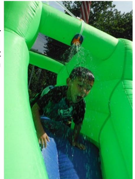
Cooling off on Water Day