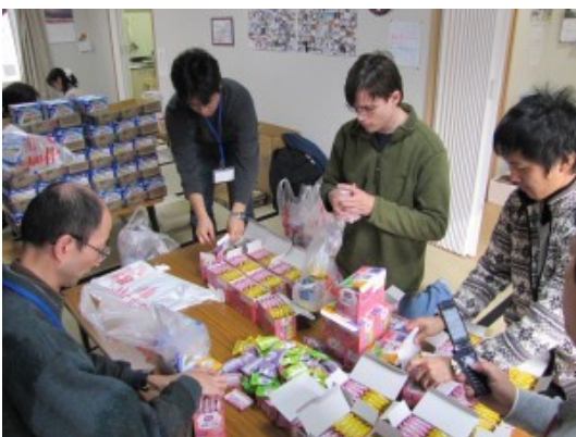
Bagging supplies for distribution in the temporary housing units in Miyako

As we write this, we are attending the Covenant's Midwinter Conference, a wonderful gathering of clergy and spouses from around the U.S. and Canada. This has given us the chance to reconnect with so many friends we have made over the years.