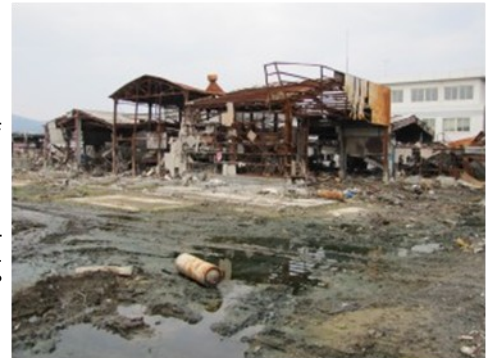
Tsunami cleanup continues

It was amazing to see the devastation caused by the March 11 th tsunami. Visits to temporary housing units were occasions to try to bring some help and hope. You can read more and see pictures from these two trips on our blog: blogs.covchurch.org/carlson/ .