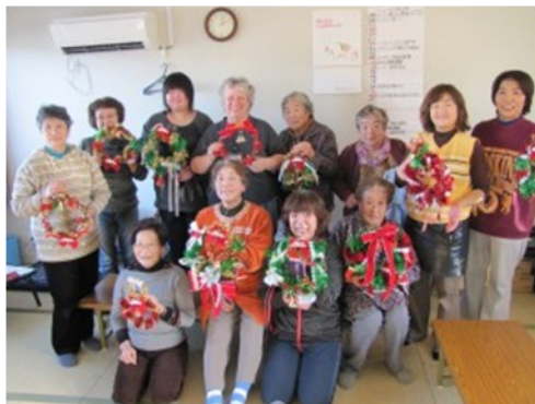
Handmade Christmas Wreaths