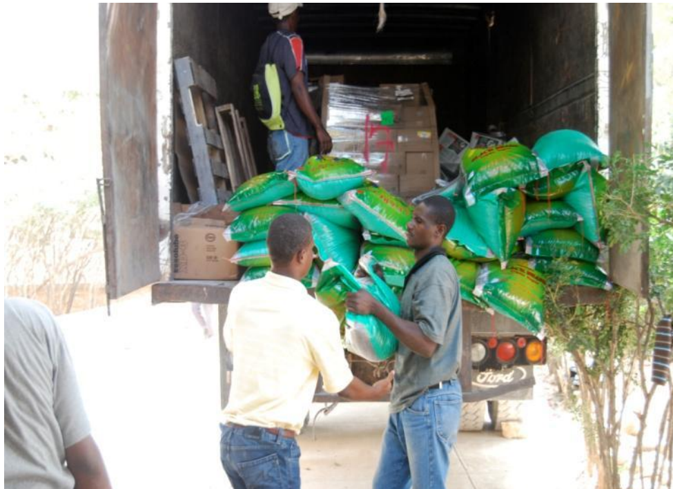
Everyone pitches in to get the food in storage for the feeding program. That is 110 gallons of cooking oil, 7,000 lbs of rice, 3,000 lbs of beans and tuna, 100 boxes of pasta, and bottled water