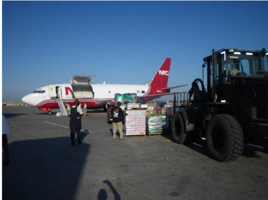
3 shipments of cargo totaling 85,000 pounds were brought right into Port-au-Prince this past week. The team was able to receive the goods and ensure that the people actually received them.