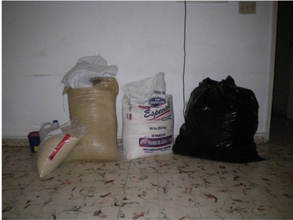
Feeding Program in Port-au-Prince left with only 2 bags of rice

CORNERSTONE FOUNDATION Compassion in Action