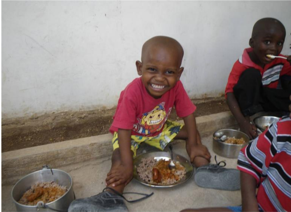
Your generosity puts a smile on the face of many in Port-au-Prince

CORNERSTONE FOUNDATION Compassion in Action