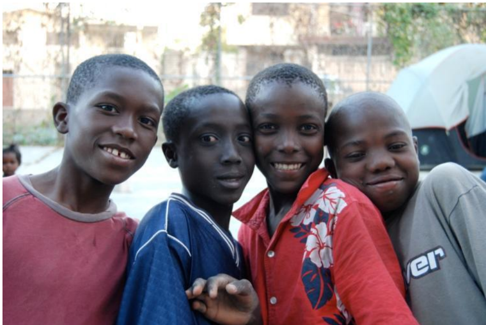
Excited about their new “tent” home. These boys pose for a picture... smiling with gratitude