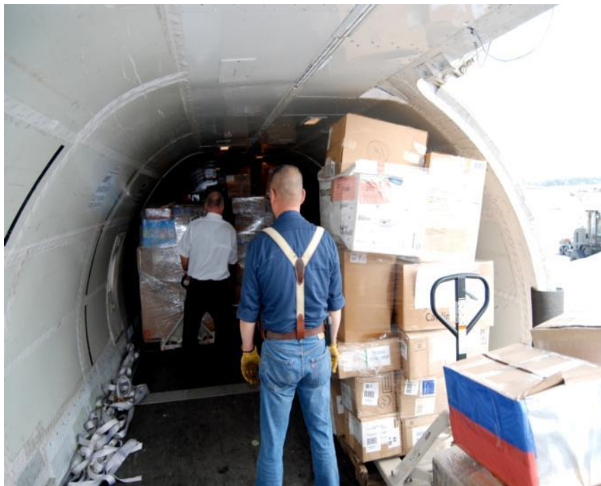
Cornerstone Foundation oversees the reception and distribution of supplies to the Haitian people