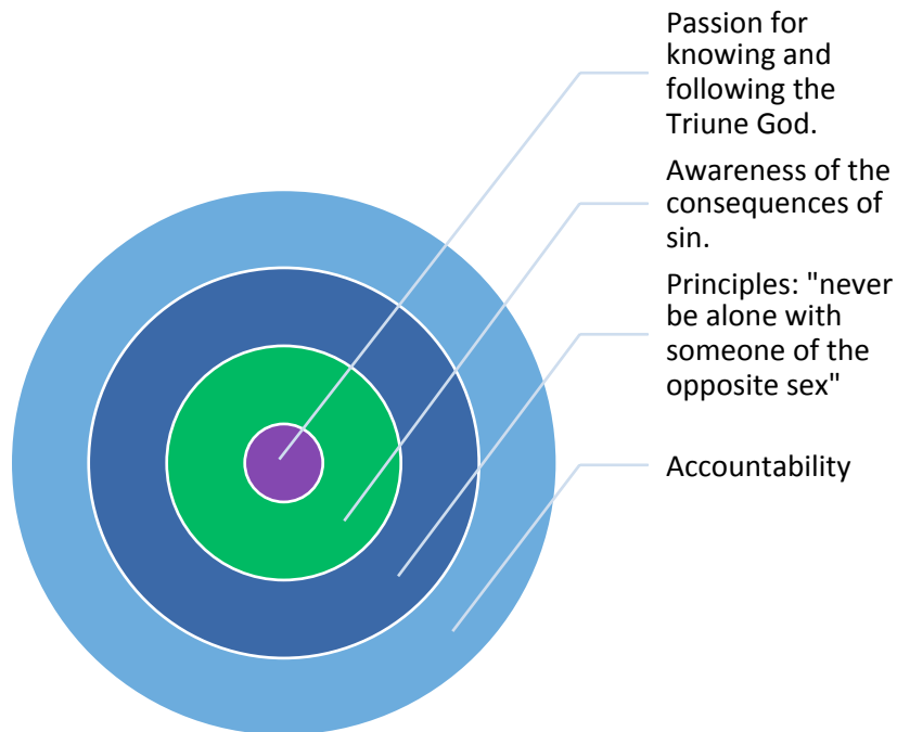
Figure 2: Fighting the sinful nature the Spirit's way