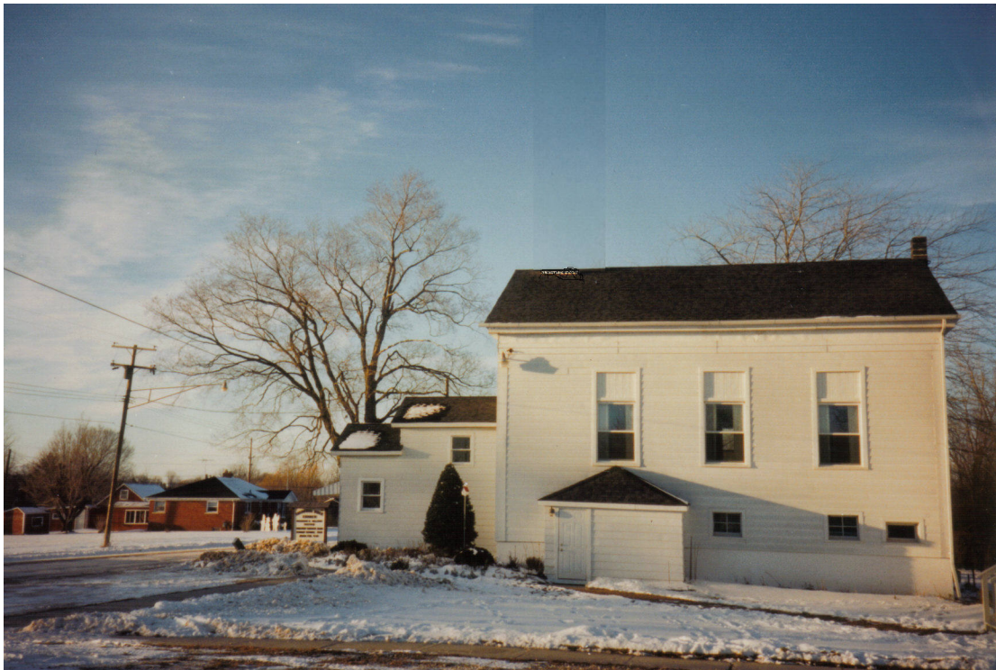
Old church without steeple