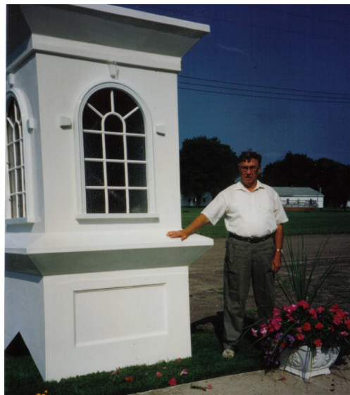
Top: Removing the steeple Left: Pastor with steeple