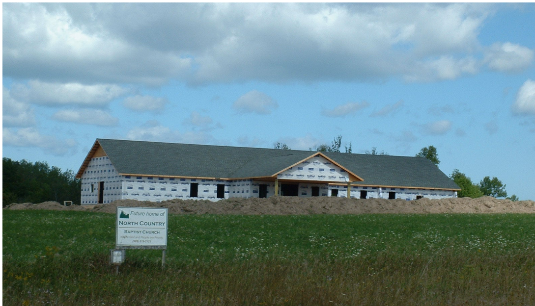
Church that bought the steeple