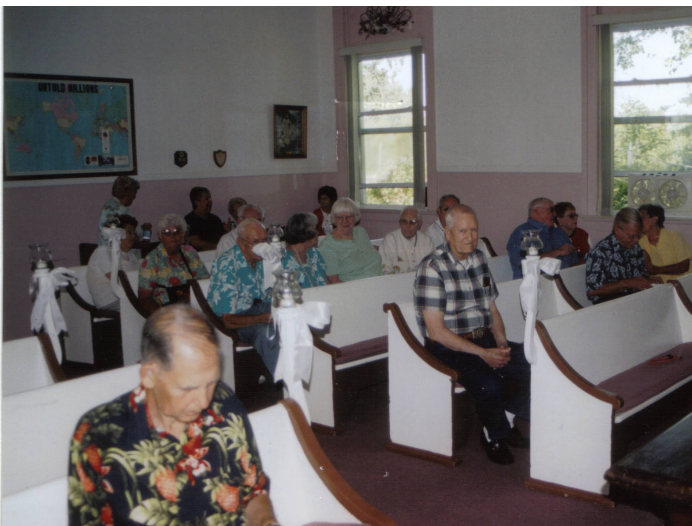
Inside the old church