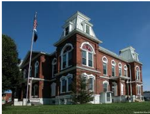
Morgan County Courthouse in Versailles.

The building will be constructed by the Jack Ballard Church Builders in the spring of 2015. The church builders have built over 100 churches, church additions and camps. This is the same group that built the new facility at our Riverwood Campus in 2011.