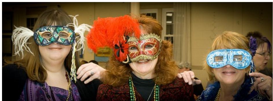
Shrove Tuesday "Mardi Gras" Pancake Supper