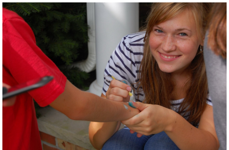
Applying "tattoos" at the church picnic