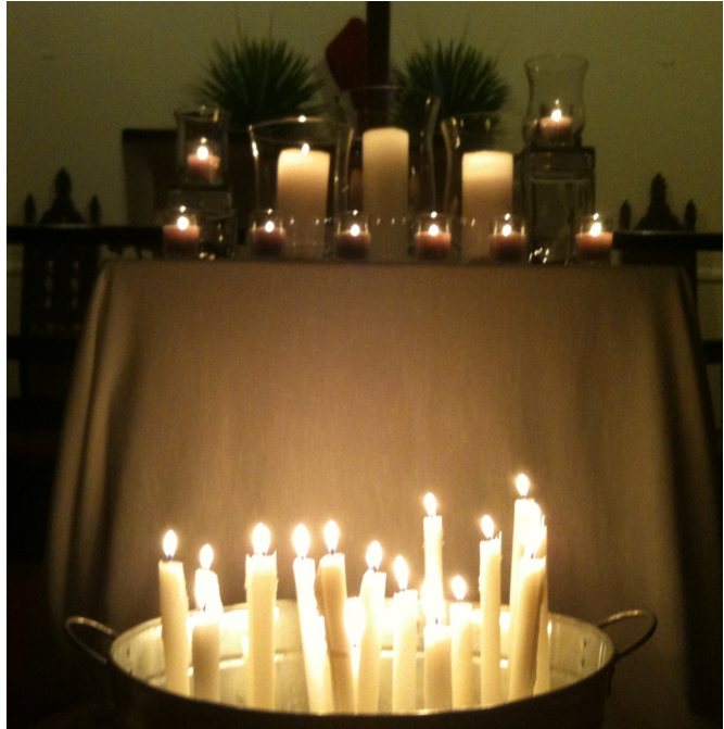
The first Taizé service in Historic Christ Church, Holy Week 2011