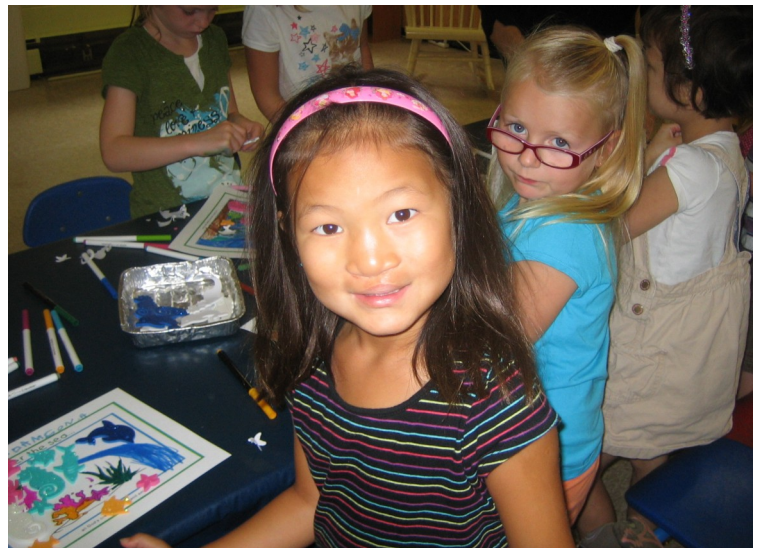
Neighborhood Vacation Bible School

Warm weather brings us together in work and play.