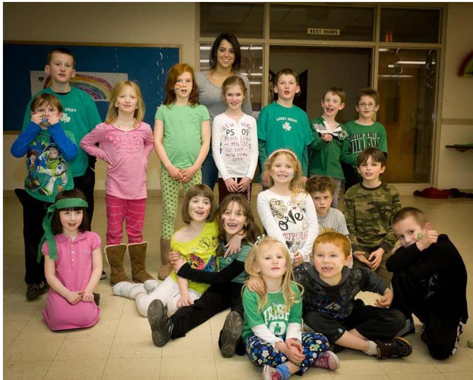
The first meeting of the Kid's Club , March 2011

The church that plays, and prays, and works together stays together.