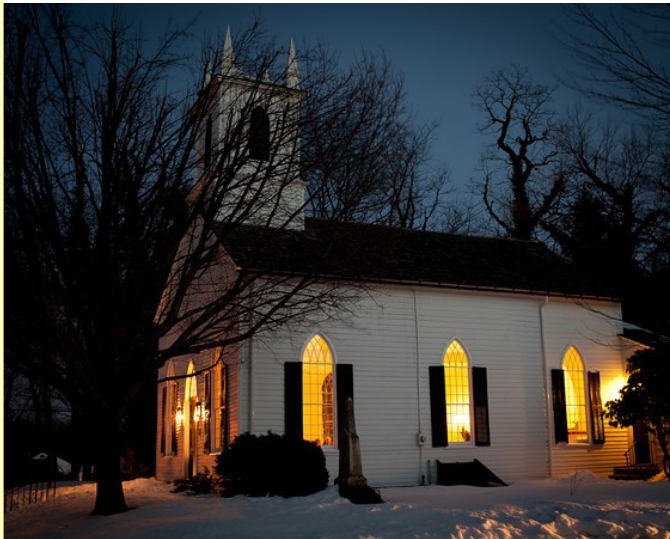
The Historic Church at Night