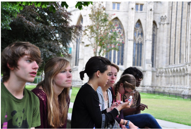
Youth pilgrimage to Northern England, July 2010.