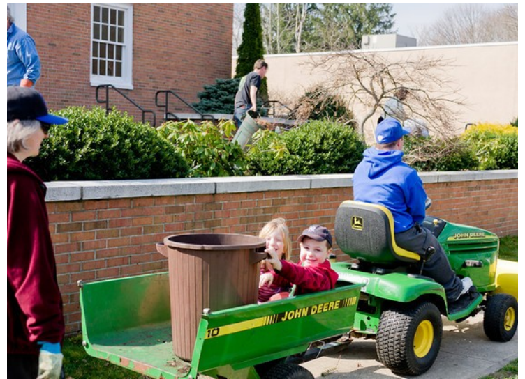
Church Clean-up Day

Warm weather brings us together in work and play.