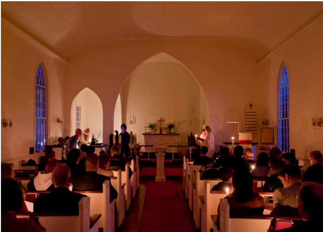
Easter Vigil 2012

We gather in darkness, kindle the new fire, and await the dawn of new life.