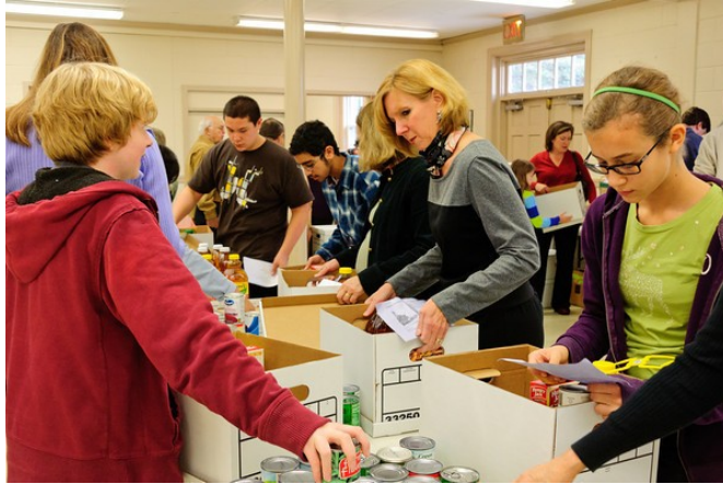
Packing family-sized boxes of food for Thanksgiving 2011.