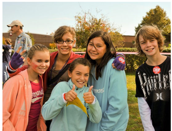
At the CROP Walk