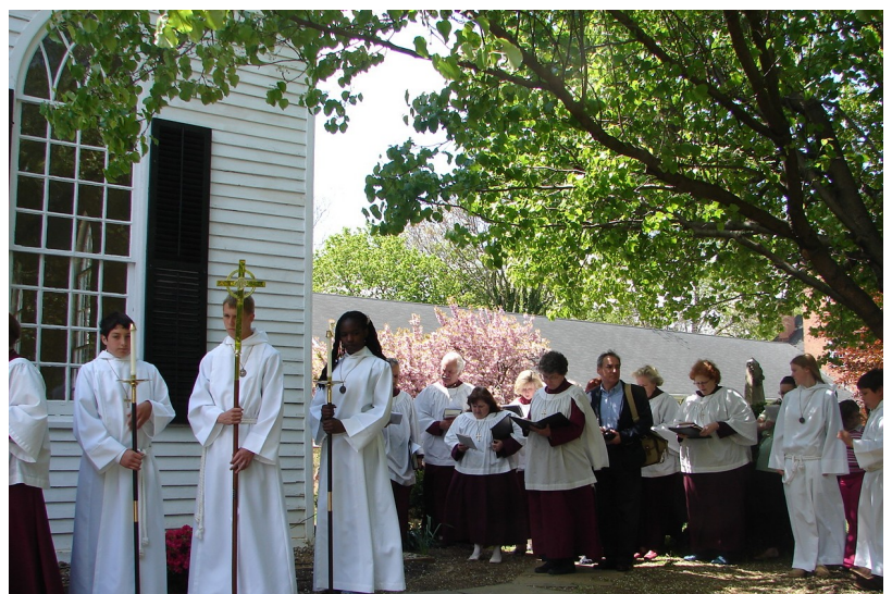
Re-dedication of Historic Christ Church