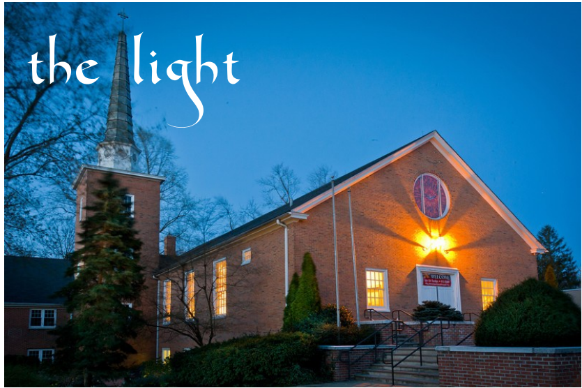
The New Church at Dawn

CHRIST CHURCH 90 Kings Highway Middletown NJ 07748 732.671.2524 www.christchurchmiddletown.org