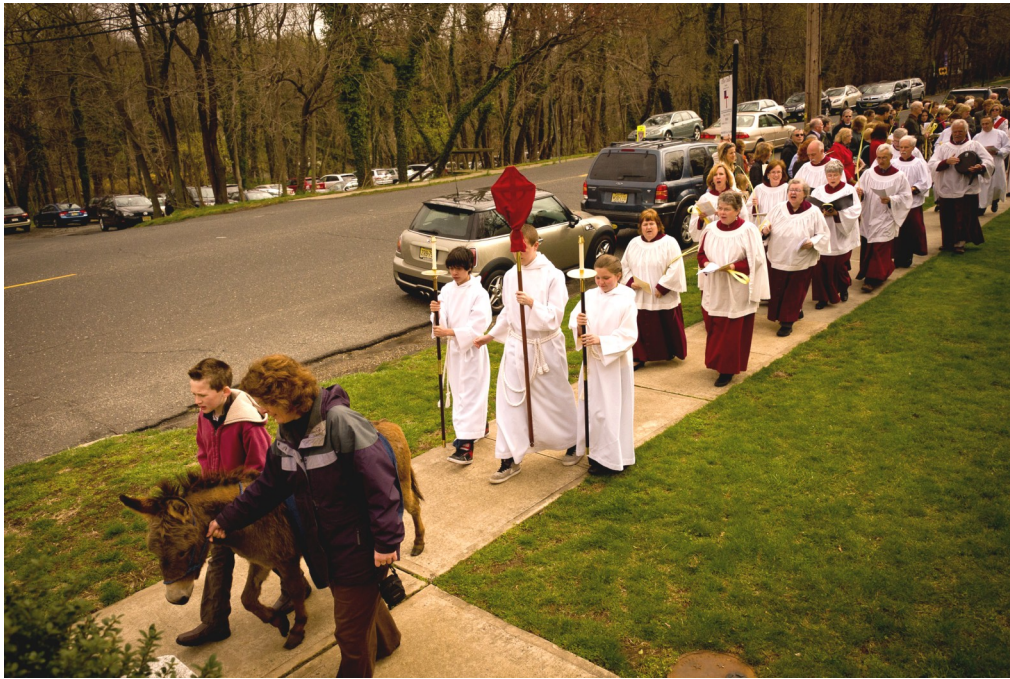
Palm Sunday 2012