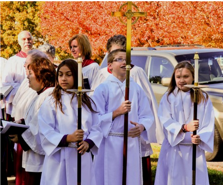
Dedication of the Historic Church windows

As the leaves turn, our life focus returns to a new season of growth and service.