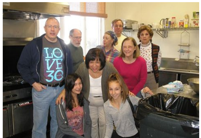
One of the Saturday crews serving lunch at St. Mark's Kitchen.