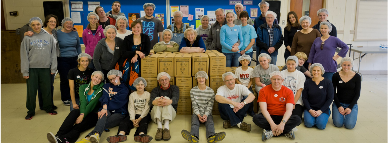
The crew that packed 10,125 meals for Stop Hunger Now, Spring 2012.