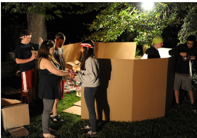
Experiencing temporary hunger and homelessness: 30 Hour Famine, 2011.