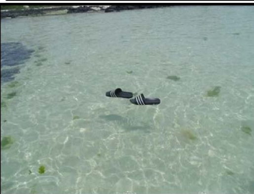
Jesus on incognito vacation