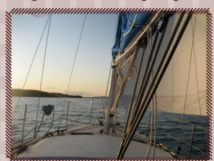
Pg 3: Sail Superior in 2011