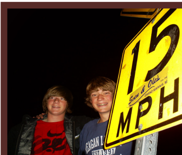
How did a Sven & Ole Sticker get here?