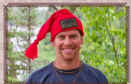
Pg 2: Whatcha doing Sarge?