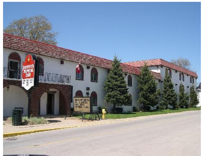
Duffy's Tavern and Motor Inn