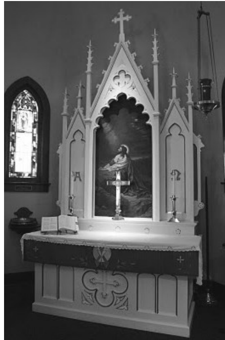
The altar at St. Peter's Lutheran, Creston, NE

Although this movie doesn't deal specifically with matters of faith and