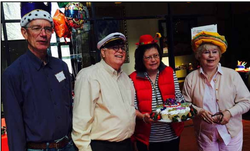
You never know what will happen at a Celebrate Life! luncheon!