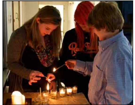
Youth light candles following Communion at Third Space.